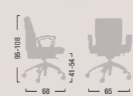
TK33-TK37 Poltrona ergonomica con oscillante mov. 1. High ergonomic armchair w/tilting mov. 1.