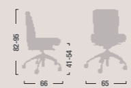
TK35 Sedia dattilo ergonomica senza braccioni mov.1. Low ergonomic chair without armrest mov.1.