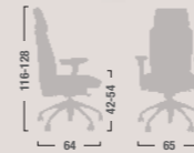
TK30 Poltrona ergonomica alta oscillante mov. 19. High ergonomic armchair w/tilting mov. 19.