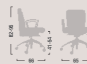
TK34/TK38 Sedia dattilo ergonomica con braccioni mov.1. Low ergonomic armchair mov.1.