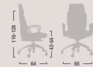
TK32 Poltrona ergonomica alta oscillante mov. 19. High ergonomic armchair w/tilting mov. 19.