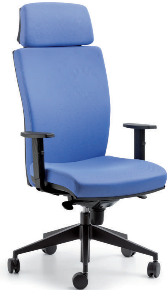
TEKNA OPERATIVE CHAIR